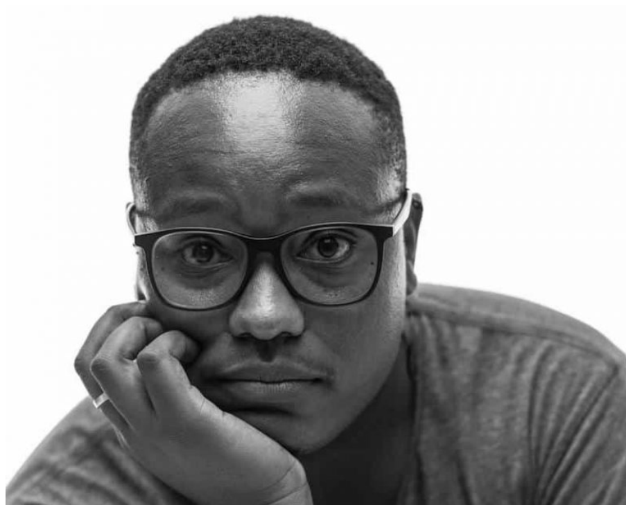
Osborne Macharia

Osborne is a self-taught Commercial Photographer and Visual Artist born and raised in Nairobi, Kenya and currently living in Vancouver, Canada. His style of photography falls within the genre of Afrofuturism, governed by two key elements – Cultural Identity and Fiction. Through storytelling and social inclusion, it creates a powerful platform to convey important messages on topics such as Equality, Inclusion, Representation, Gender Abuse, Ivory poaching, FGM, Albinism, Dwarfism, Conservation and Elderly Care.