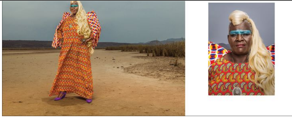
“Osborne Macharia: Stories of the Future Past” Magadi Montague Contemporary © Osborne Macharia contemporary

Macharia’s unique brand of Afrofuturism suggests not just an attempt at historical revisionism, but a way to draw attention to issues – from gender abuse to FGM to dwarfism to elderly care – that too often fall out of the limelight. His extraordinary countermove is evidenced in his dreamlike images, where viewers are transported to an alternate realm; where the subject at hand is conveyed without distraction, shedding preconceived notions of what is possible and what is fantasy.