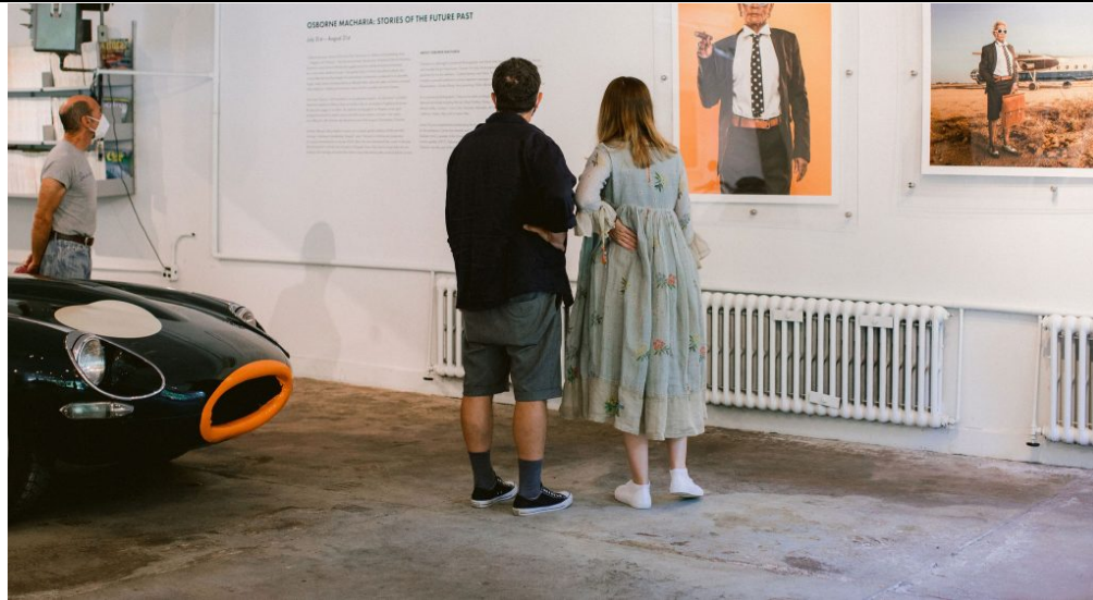
Art by @osborne_macharia brought to you by @montaguecontemporary