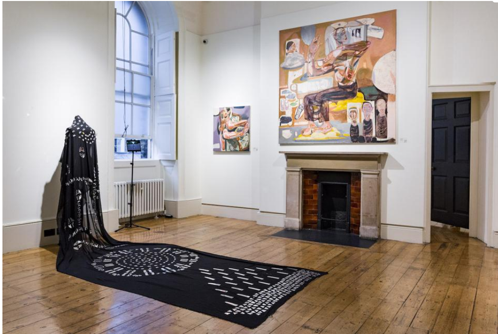
Installation view at Addis Fine Art with work by Tsedaye Makonnen and Tesfaye Urgessa, at 1-54 Art ... [+]

1-54 Contemporary African Art Fair , Somerset House runs until 10 October 2020. Tickets are on sale for the public day on Saturday 10 October, with 2-hour time slots are going fast (10:00-20:00). Online showcase and sales will continue at Christie's (until 12 October) and Artsy (until 22 October).