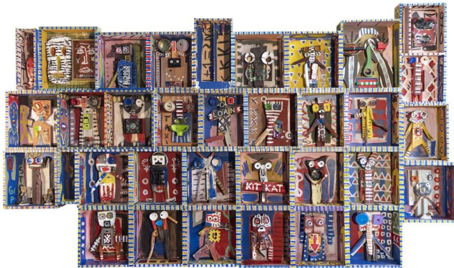
Nelo Teixeira, Untitled, from the series Lost Fragments, mixed media at 1-54 art fair, London ... [+]