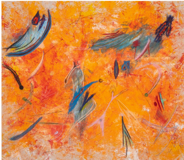
Muna Malik, Spice Dune .