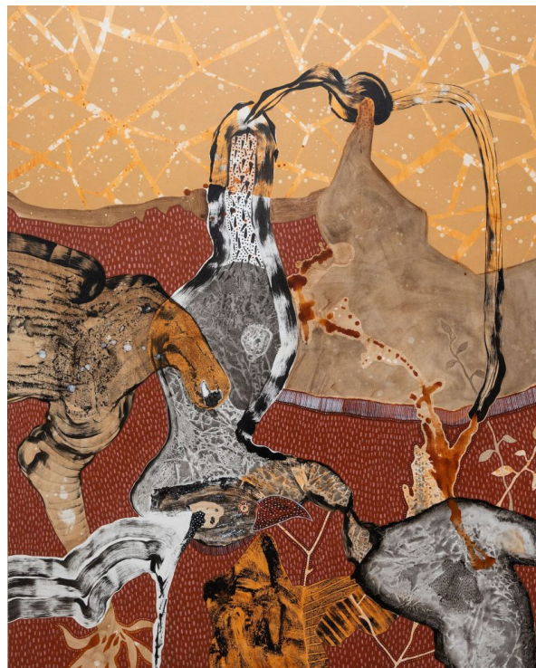
Marc Standing, The Era of Deep Time . Courtesy of Montague Contemporary.

See images from " African Abstraction (https://www.artnet.com/galleries/montague-contemporary/african-abstraction) ," below.