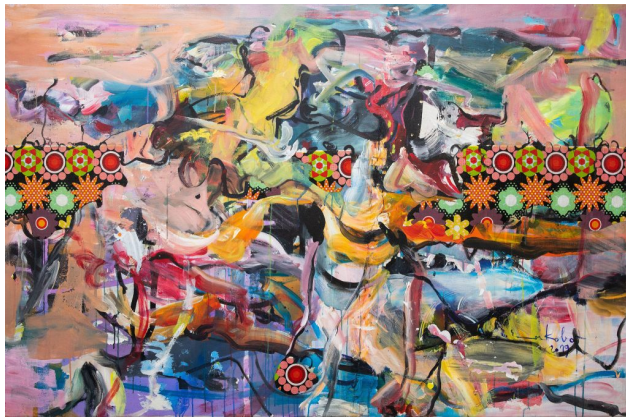
Bouvy Enkobo, Ecstasies .